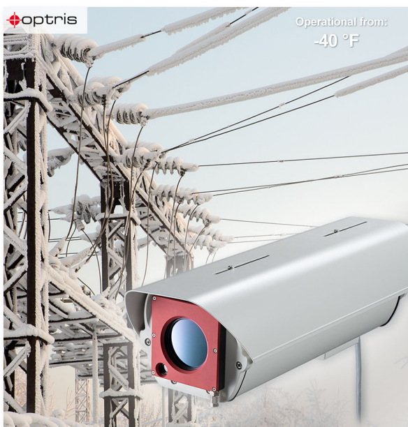
Condition monitoring in cold regions up to -40\text{ }^{\circ}\text{F}