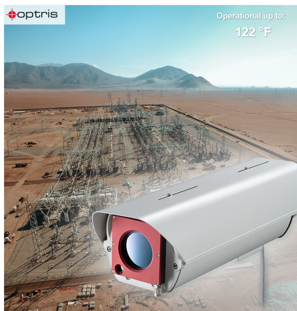
Condition monitoring in hot regions up to 122\text{ }^{\circ}\text{F}