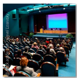
Schools / Universities