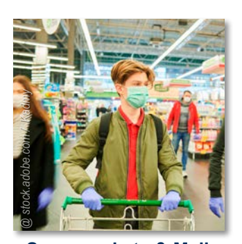
Supermarkets & Malls