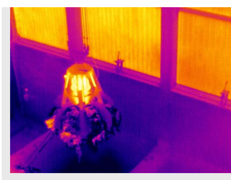
The Optris infrared cameras produce a thermal image, showing critical temperatures.

Depending on the level of installation, just one or also multiple infrared cameras can be used. If a larger area is to be monitored, these can be mounted on a pan-tilt head. This then looks systematically across the monitoring area. The software combines the images taken with the swivel head into a single composite image. Optionally, the system can also be equipped with an additional color CCD camera, which records a traditional video image.