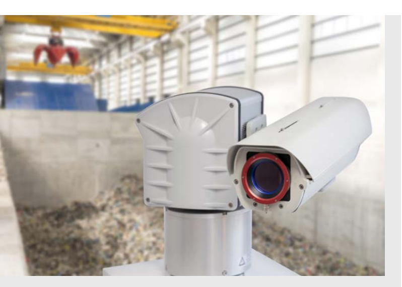
The IRIScan FS system is able to detect fires at an early stage using infrared measurement technology.